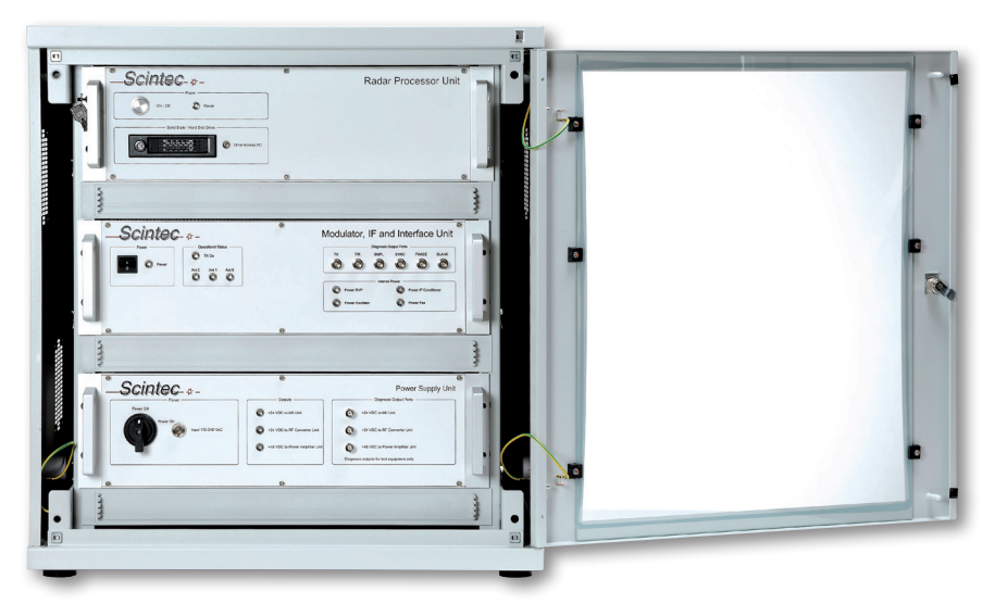
Scintec LAP®3000 indoor units

The new SIRP Digital IF Processor was specifically developed for radar wind profilers. It combines Advanced Coherent Noise Suppression ACNS, vertical signal oversampling, 16 chip binary pulse coding, true Gaussian matched filters, and freely programmable height gates. Vertical range resolution can be set to values finer than 50 m. The revolutionary ACNS cancels distinct radio frequency interferences and improves data quality at sites suffering from radio pollution.