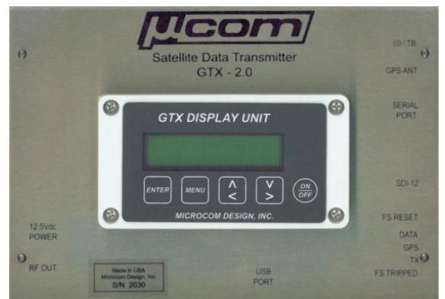
GTX-2.0 with Optional Display/Keypad Interface